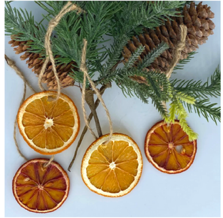
ALL-NATURAL DRIED CITRUS ORNAMENTS. ORANGE, LEMON, AND LIME. SIZES AND COLORS WILL VARY