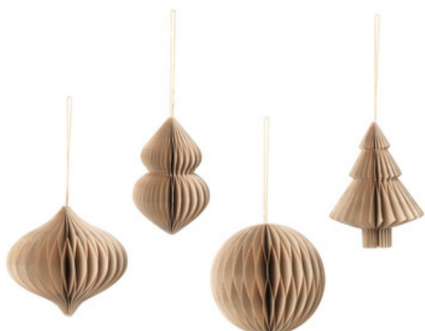
DECORATIVE PENDANT, Ø 9 X H 10 CM, NATURAL BROWN