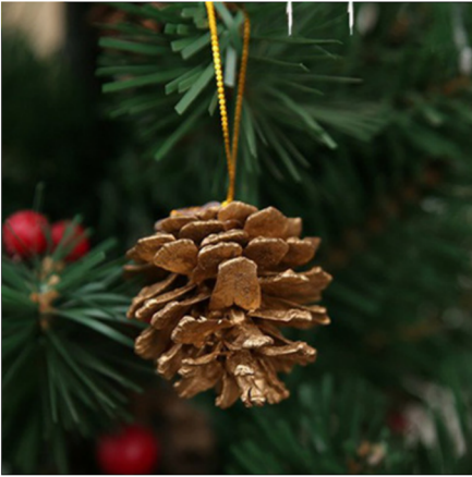
DRIED PINE CONES ON JUTE STRING. SIZES AND COLORS WILL VARY