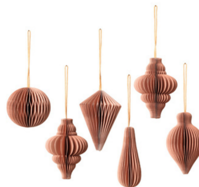
DECORATIVE PENDANTS, Ø 5 X H 7 CM, DUSTY PINK