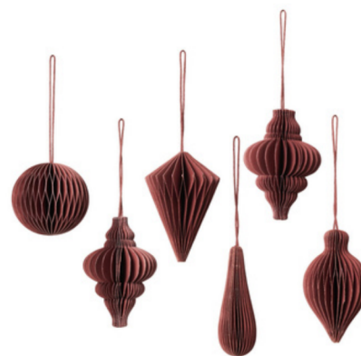
DECORATIVE PENDANT, Ø 5 X H 7 CM, PLUM