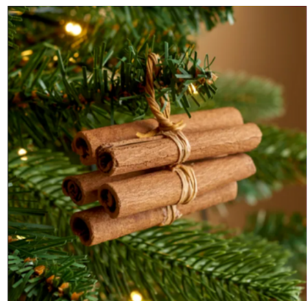
CINNAMON BUNCHES BUILDS COMFORT