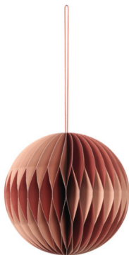
DECORATIVE PAPER BAUBLE , Ø13 CM, POMPEIAN RED / DUSTY PINK