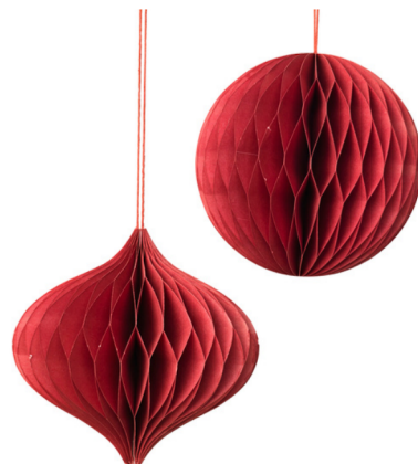
DECORATIVE PAPER BAUBLE , Ø13 CM, POMPEIAN RED