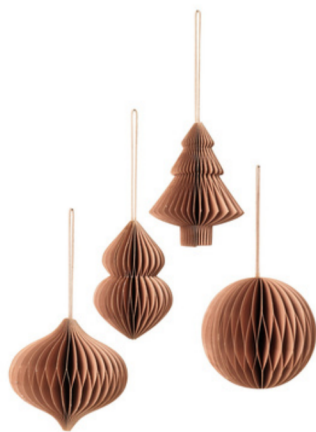
DECORATIVE PENDANTS, Ø 9 X H 10 CM, INDIAN TAN