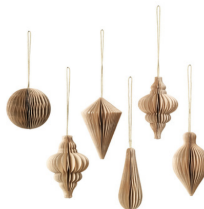
DECORATIVE PENDANT, Ø 5 X H 7 CM, NATURAL BROWN