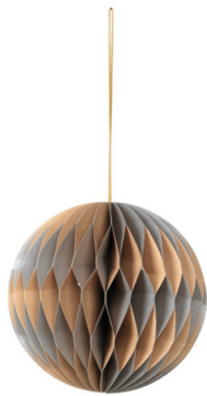
DECORATIVE PAPER BAUBLE , Ø13 CM, SILVER / DUSTY PINK

Our Christmas Mix Decorative pendants are made of recycled paper .