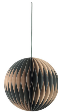
DECORATIVE PAPER BAUBLE , Ø13 CM, DUSTY PINK / DEEP FOREST