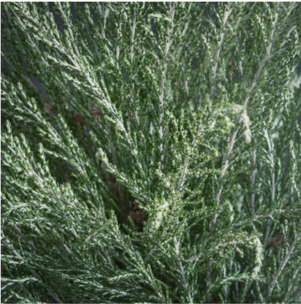
SPRINGS OF SILVER SUSSEX. OFFERING CONTRAST