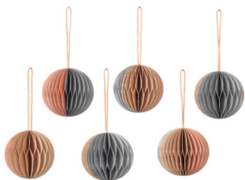
DECORATIVE PENDANT, Ø 9 X H 10 CM, DUSTY PINK / SILVER