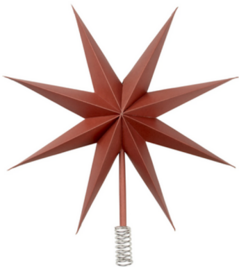
PAPER STAR CHRISTMAS DECORATION POMPIEAN RED