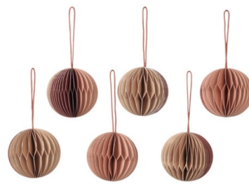
DECORATIVE PENDANT, Ø 5 X H 7 CM, DUSTY PINK / NATURAL BROWN