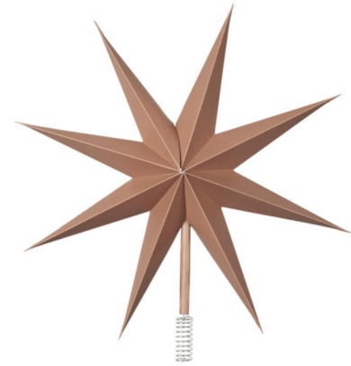
PAPER STAR CHRISTMAS DECORATION PLUM