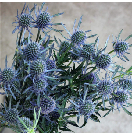
BLUE THISTLE BUILDS CONTRAST