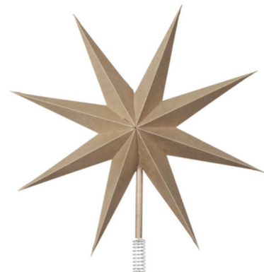
PAPER STAR CHRISTMAS DECORATION NATURAL BROWN