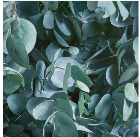
EUCALYPTUS CUTTINGS INCREASE SCENT & CONTRAST