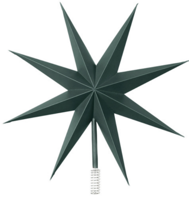
PAPER STAR CHRISTMAS DECORATION FOREST GREEN

Our Top star Ø30 cm is an elegant paper star with a spiral spring for setting on the top of a Christmas tree.