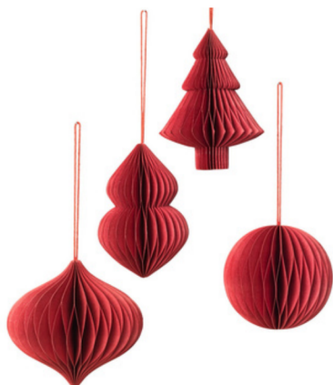
DECORATIVE PENDANT, Ø 9 X H 10 CM, POMPEIAN RED